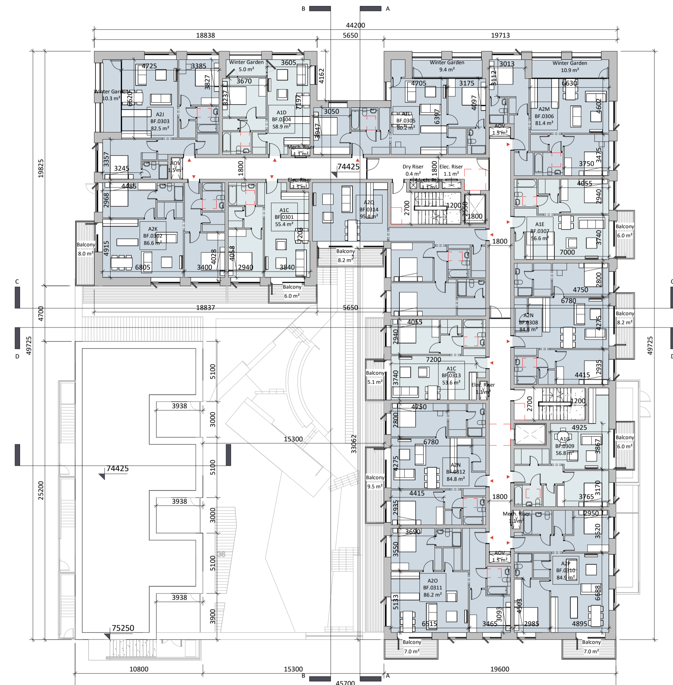
2 Block F Level 03 1:200